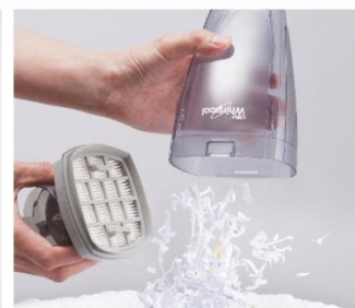
Cleaning up the dust is easy by simply removing the dust cup