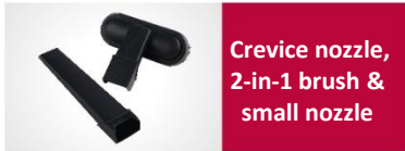
Crevice nozzle, 2-in-1 brush & small nozzle