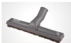
Parquet brush nozzle