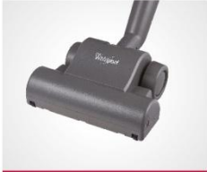
Turbo brush nozzle