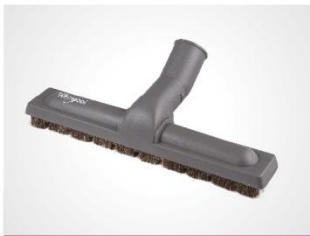
Parquet brush nozzle