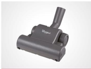
Turbo Brush Nozzle