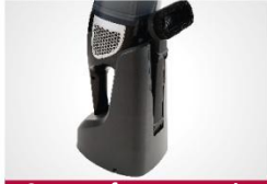
Storage for accessories