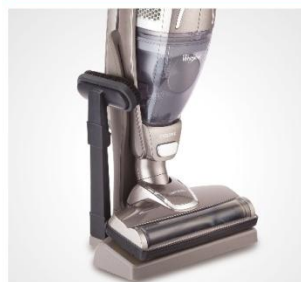
Accessories can be stored in the charging stand