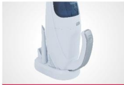
Charging base & Storage for accessories