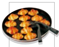
脆焗盤連手柄 Crisp plate with handle