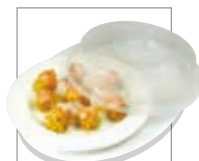
微波爐蓋 Microwave cover