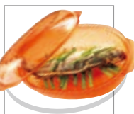
多用途蒸籠 Multi-purpose steamer