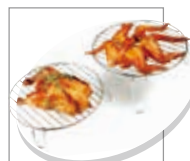
高低燒烤架 High & low grill racks