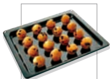
專業四方形烤盤 Professional square grill plate